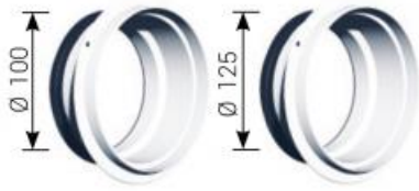
Connector for plasterboard ceiling installation Ø 80, 100, 125 (MPG)