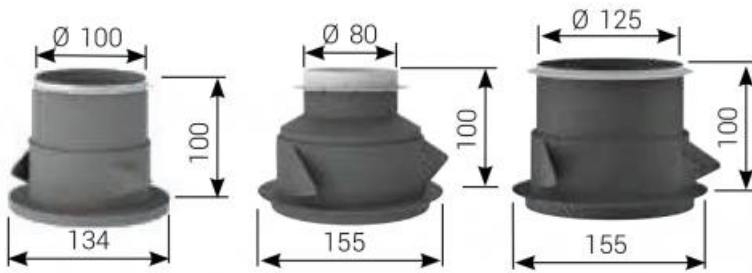
Wall crossing connector Ø 80 and Ø 125 (MTD)